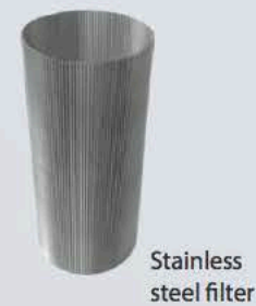
Stainless steel filter