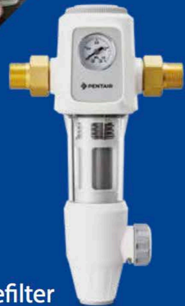
Pentair Backflush Prefilter

Smart, Sustainable Water Solutions. FOR LIFE.