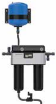
Renu UF-FC20BB SA31026