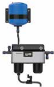
Renu UF-FC10BB SA31025

Provide multiple equipment needs with high volume of quality water