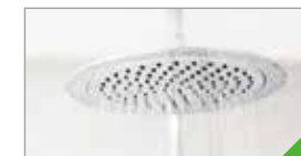
Taking a shower

During bathing, some volatile gases may enter the body through the nasal cavity.