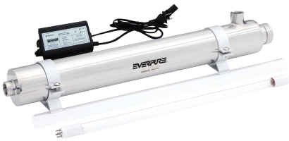
B: PFB-006 Ultraviolet Sterilizer