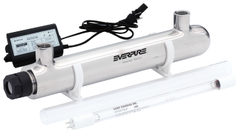
A: PFB-002 Ultraviolet Sterilizer