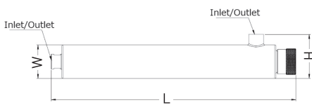
B: PFB-006 Ultraviolet Sterilizer