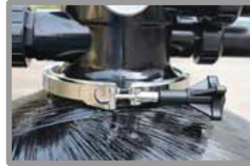
Stainless steel clamp valve