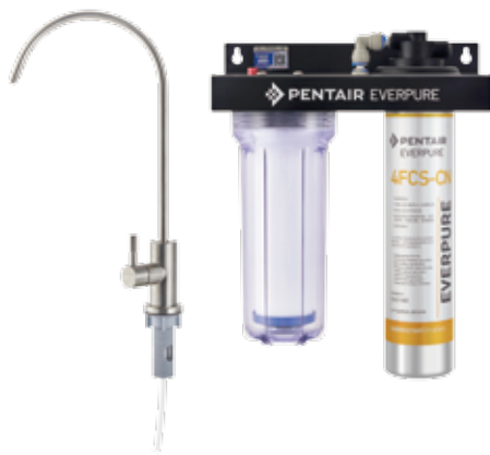
Everpure Combo-4FCS-CN Commercial Water Purifier

(The system comes with a standard stainless steel faucet.)