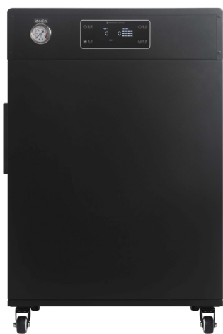
CMRO-1000 commercial water purifier